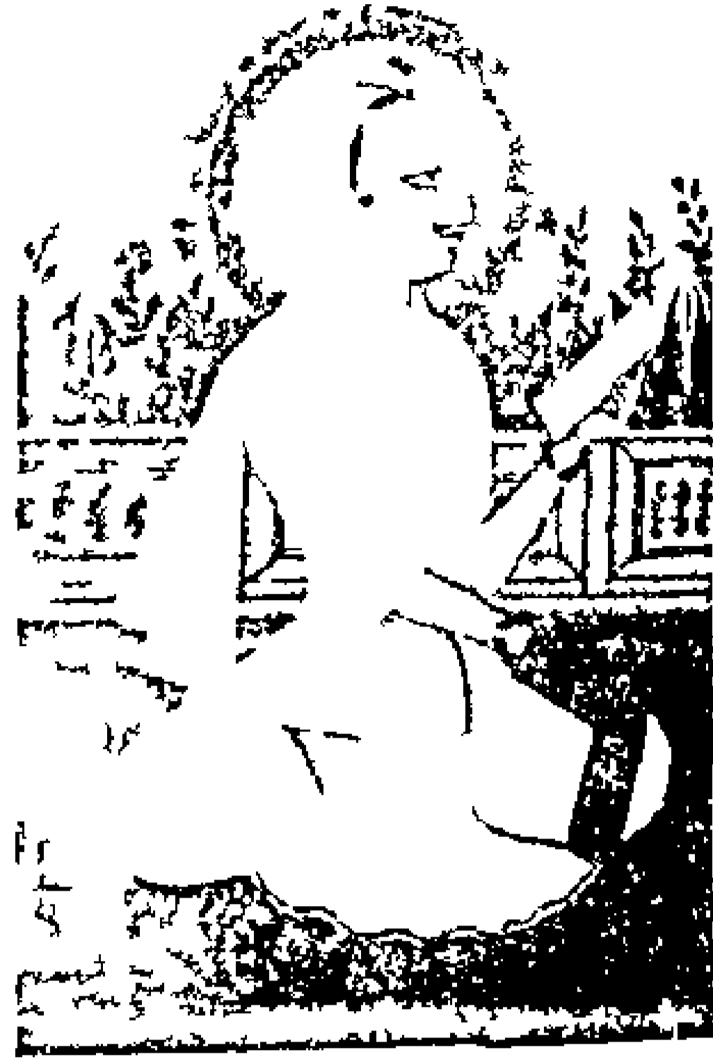
swami Shri Giradharaji See page 346